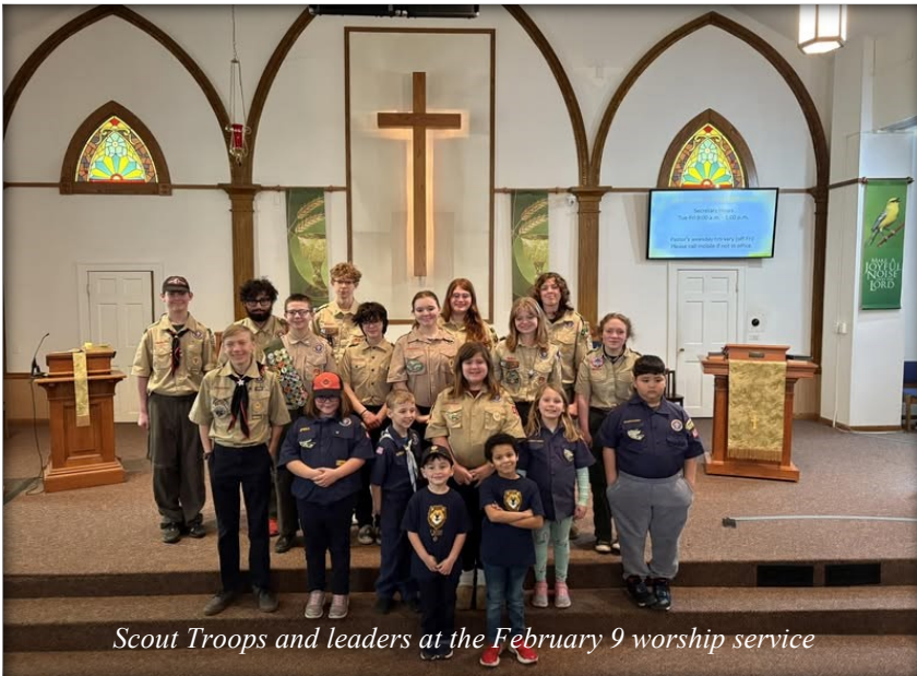
Scout Troops and leaders at the February 9 worship service

Thank you to the Scouts, their leaders and families for participating in the worship service and for the lovely breakfast afterwards on February 9th.